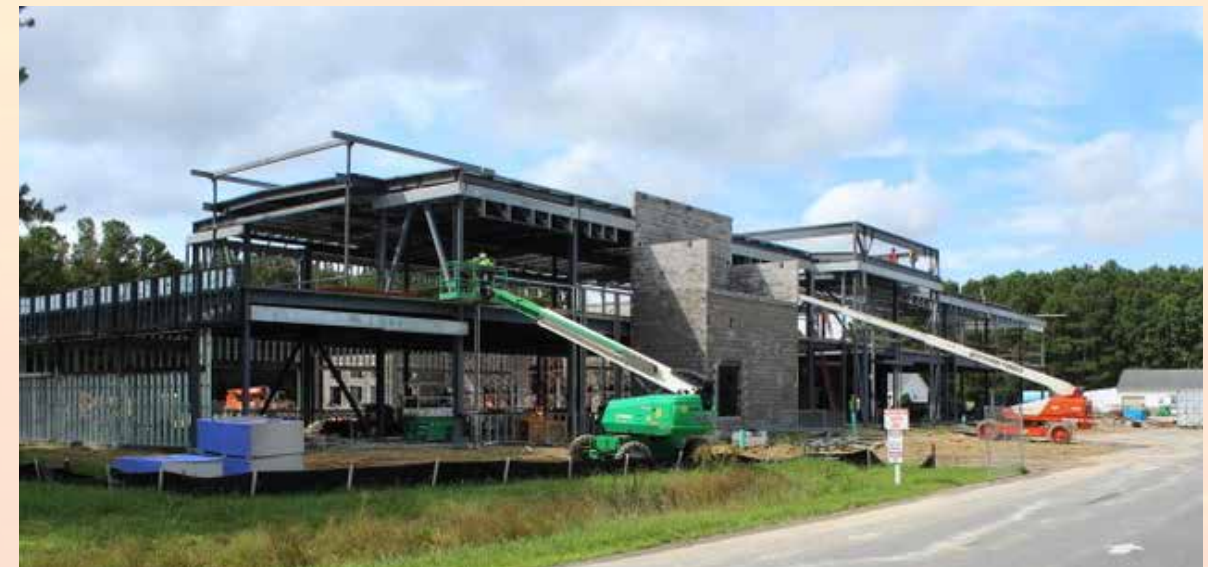
New construction on the campus of Eastern Shore Community College.

Endowments created by partner organizations are identified as “Organizational Funds” within the ESVCF assets. ESVCF maintains an ongoing program of creating Organizational Funds for local nonprofit organizations. These relationships allow for management of dedicated endowments by the Hampton Roads Community Foundation through ESVCF while generating an annual income for the nonprofit. The Eastern Shore Community College Foundation created the first Organizational Fund with ESVCF in 2006. Since then, many additional partner groups have created endowments. ESVCF looks forward to assisting additional partner groups in the years ahead through this growing program.