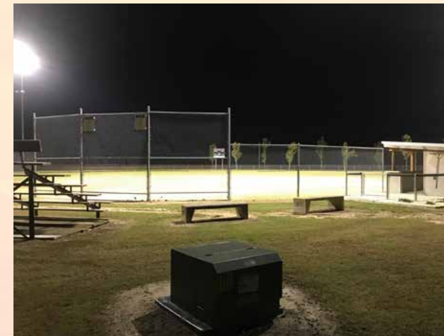
New lighting at Randy Custis Memorial Park

Detailed Financial Statements Are Available Upon Request