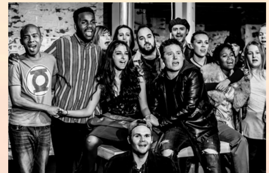
North Street Playhouse cast performing the musical "Rent"

Improve the quality of life for families & communities, particularly in the areas of basic human needs