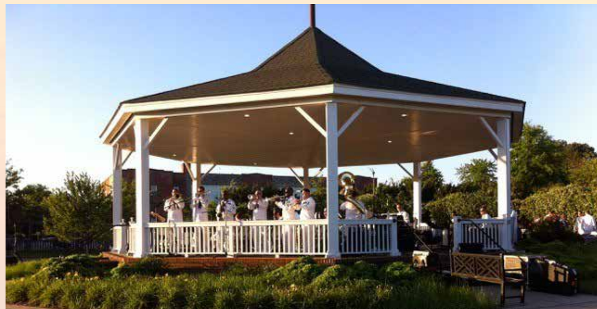
The Gazebo in Cape Charles Central Park.