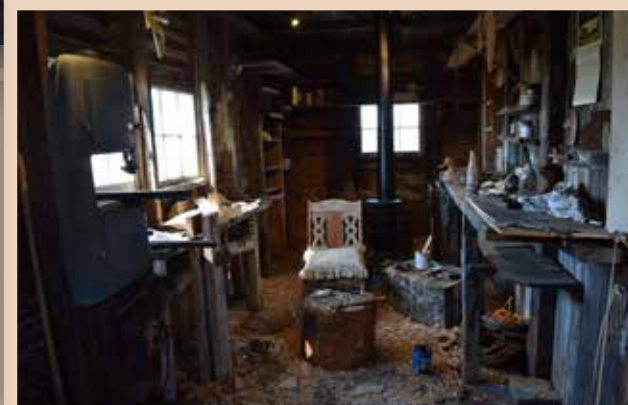
Completed Miles Hancock Carving Shed at the Museum of Chincoteague Island (top center) Completed exhibit side (bottom left), Completed carving side (bottom right)