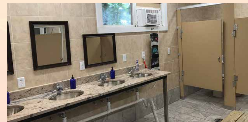
Renovated Bath House Occohannock on the Bay